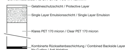
Layers ADOX CHS 100 II Sheetfilm Schichtaufbau ADOX CHS 100 II Planfilm

In 35mm and 120 format ADOX CHS100 II has two anti halation layers.